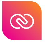
Zoho Phonebridge plugin